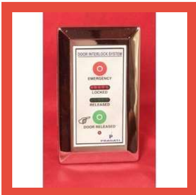
Door Inter Locking System