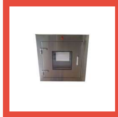
Static Pass Box