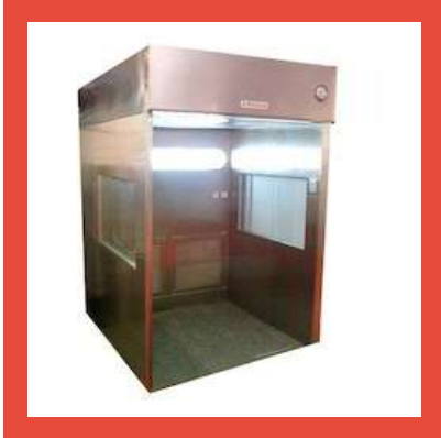
Powder Dispensing Booth