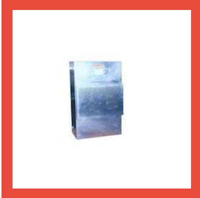
Fan Filter Unit