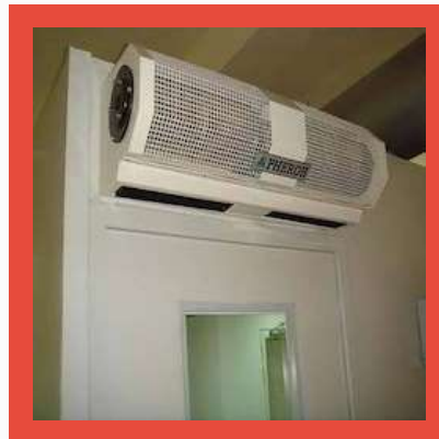
Compact Air Curtain