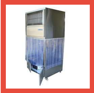
Mobile Laminar Air Flow