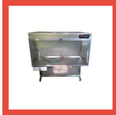
Air Cleaning Equipment for Hotel Industry