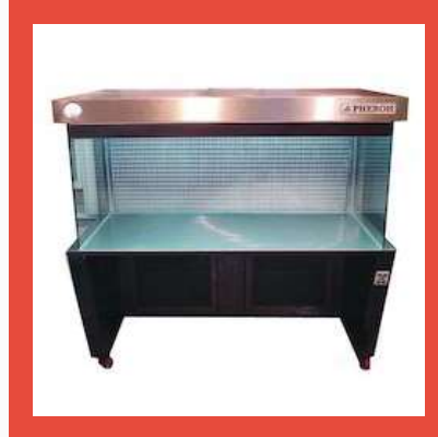
Horizontal Laminar Air Flow Cabinets