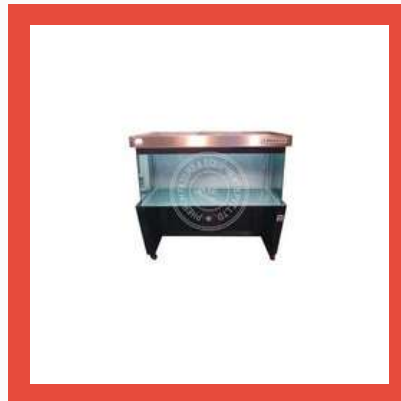
Vertical Laminar Air Flow