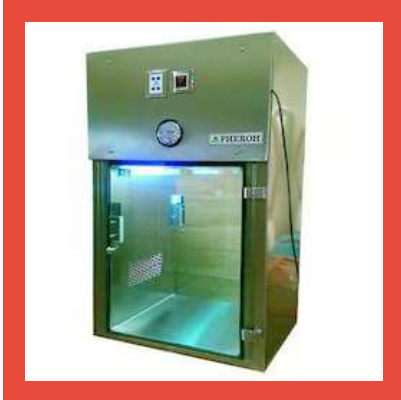
Dynamic Pass Box