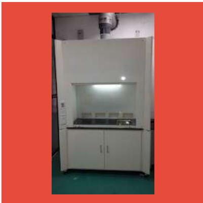
Steel Fume Hood