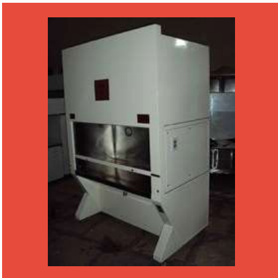
Biosafety Cabinet Class A 2 Type