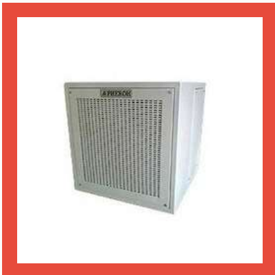
Industrial Pressure Modules