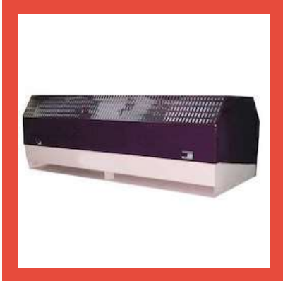
Air Cleaning Equipment for Shopping Malls