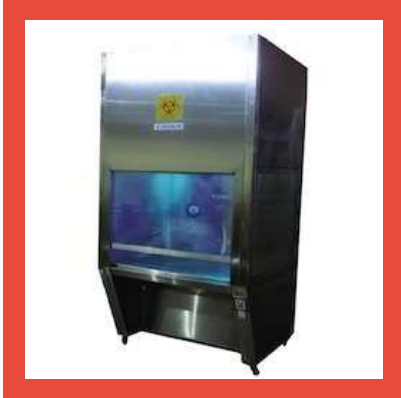
Biological Safety Cabinet