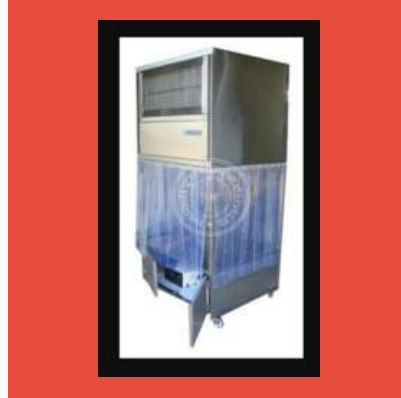
Air Cleaning Equipment For Medical Industry