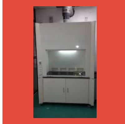
Standard Fume Hoods