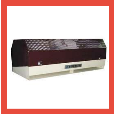
Air Cleaning Equipment for Institutional Building