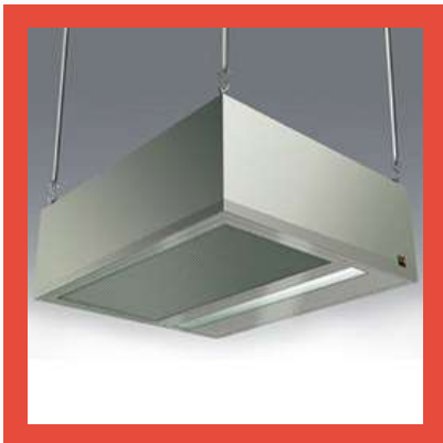
Ceiling Suspended Laminar Air Flow