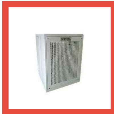
Positive Pressure Module