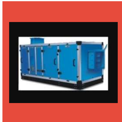
Air Handling Unit